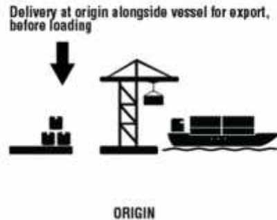
Diagram: FAS involves the seller delivering goods alongside the shipping vessel at the point of origin, including the costs of offloading the goods onto the port.